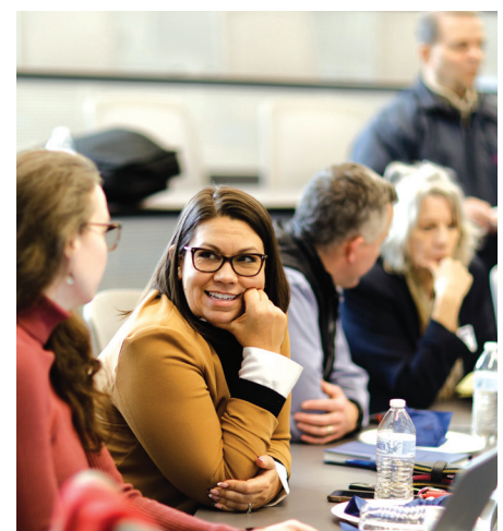
Event attendees sharing orientation time at the Berkshire Innovation Center.