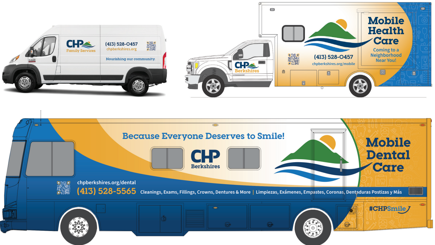
CHP's new fleet of mobile health vehicles including a refrigerated van for food delivery (top left), a second medical vehicle (top right), and a mobile dental clinic (bottom).