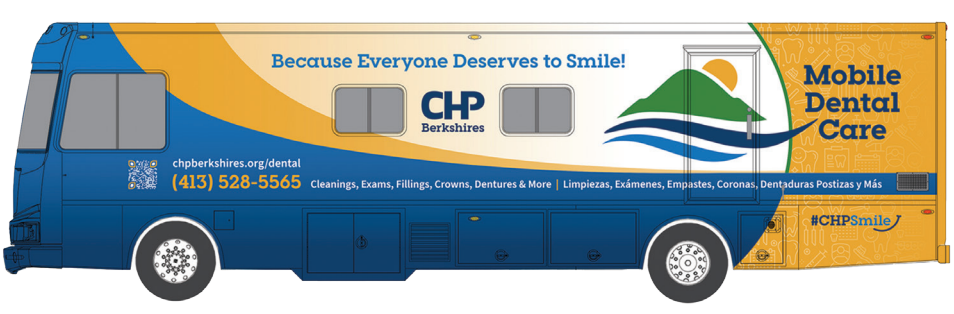
CHP's Mobile Dental Clinic will be home to Great Barrington Family Dental during construction of its new office space.

Until that permanent space is complete, CHP will soon locate a new Mobile Dental Unit at 444 Stockbridge Road in Great Barrington, which will enable us to bring dental patients back to South County. Once the Great Barrington Dental practice is up and running, the Mobile Dental Unit will be deployed across the county, bringing dental care services to rural communities, schools, and places that improve access to dental care for Berkshires residents.