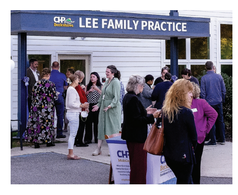
CHP staff and guests mingle after the ribbon cutting at CHP Lee Family Practice.

practice now has exam tables to accommodate larger patients and more adjustable positions, ensuring patients' optimal comfort during their healthcare visits.