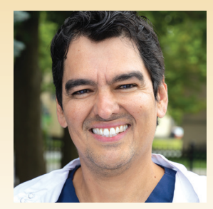
Dr. Miguel Ostos-Raybaudi Neighborhood Dental Center